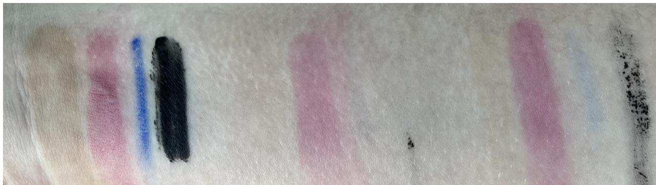
Wiped three times