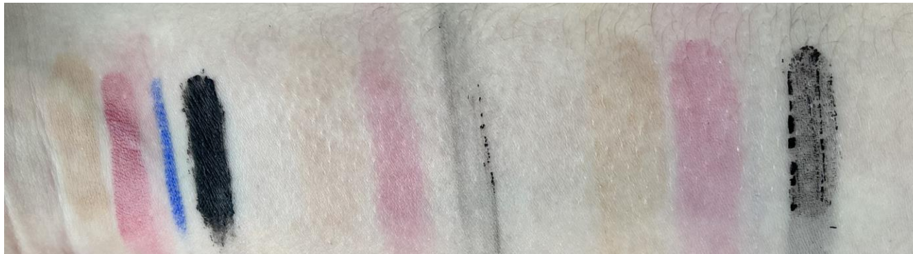
Wiped three times